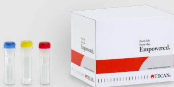
Celero DNA-Seq Universal Plus mRNA-Seq kit selection