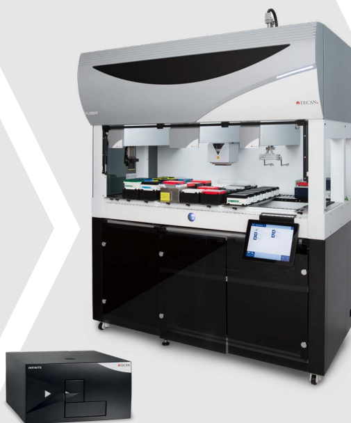
NGS Fluent package + Infinite reader